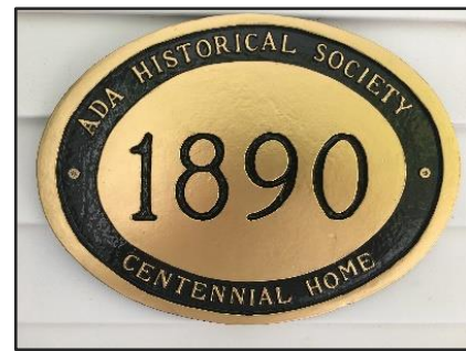
Sample Exterior Plaque